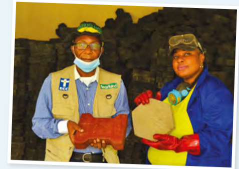
📷 Creating paving slabs from recycled plastic in a Tearfund-supported project in Kinshasa, DRC.

What would you like to give thanks for today?