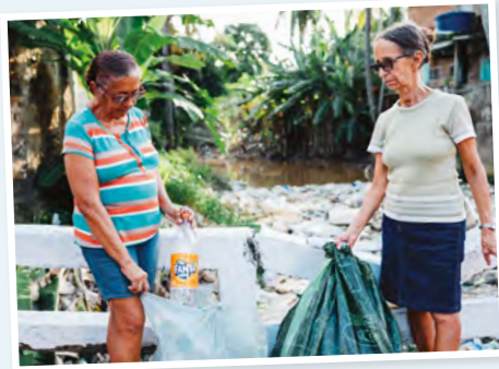
📷 The Clean River, Health City project involves the community in Coqueiral, Recife, Brazil, in tackling plastic pollution.